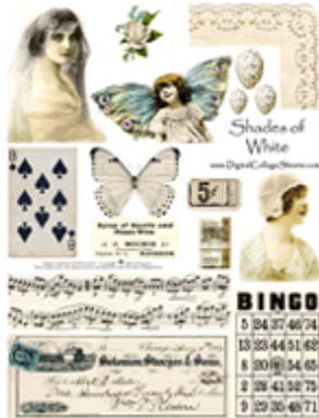
Shades of White