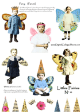
Little Fairies #4