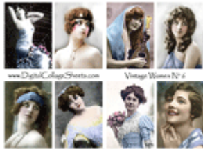
Vintage Women #6